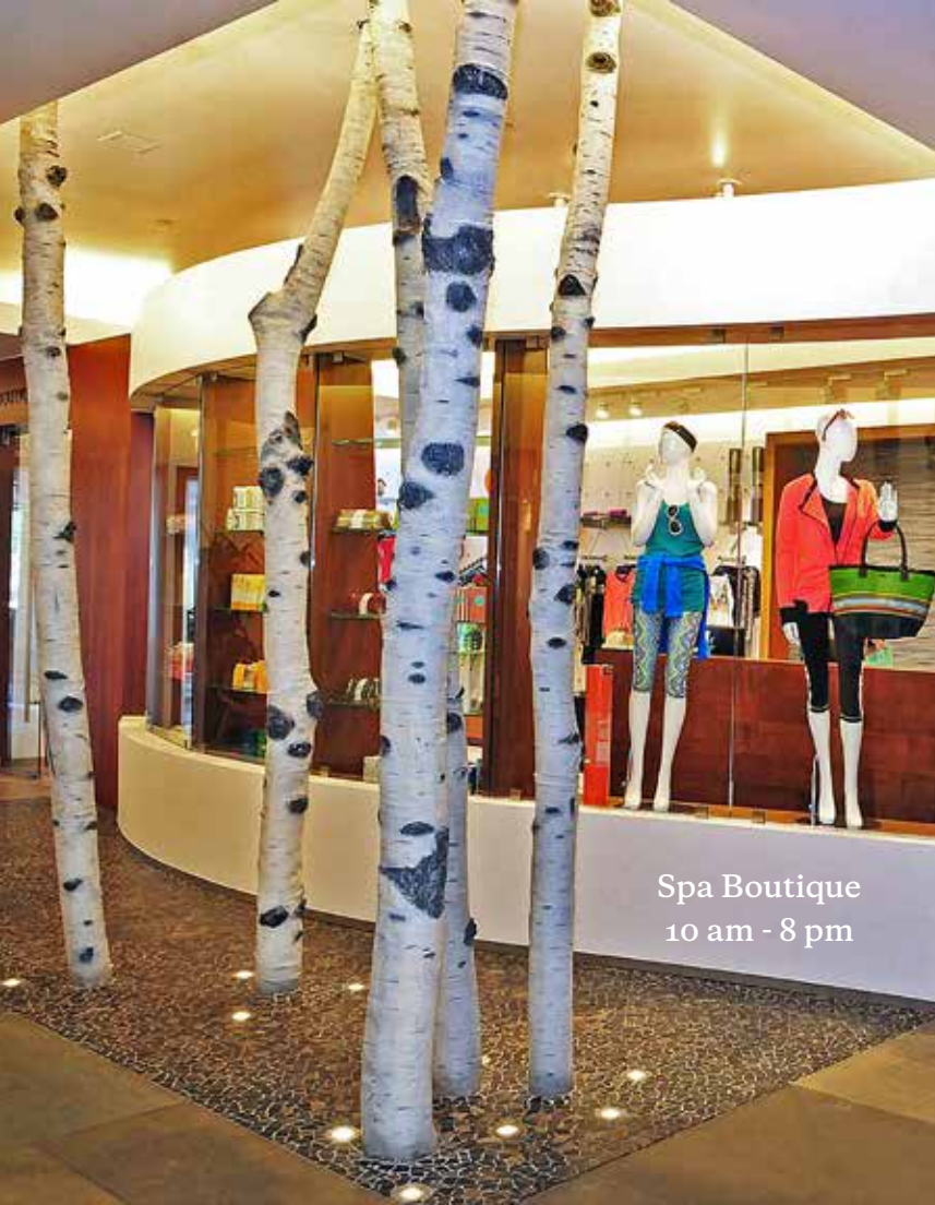
Spa Boutique 10 am - 8 pm